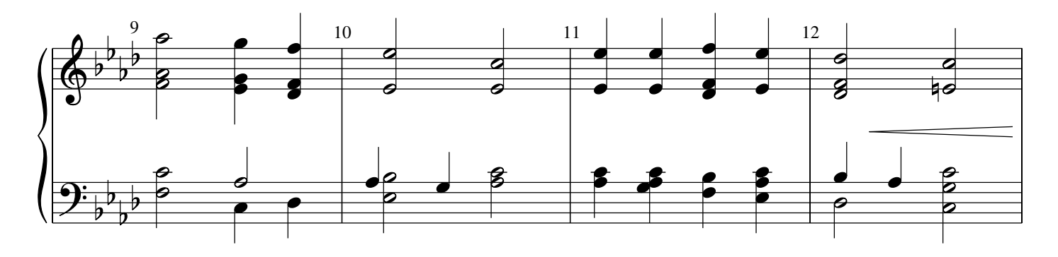
© 2010 Agape (a Division of Hope Publishing Company) Carol Stream, Illinois 60188. All Rights Reserved.